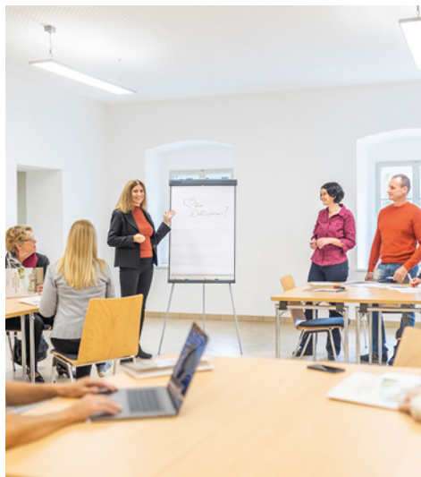
Meeting and seminar rooms